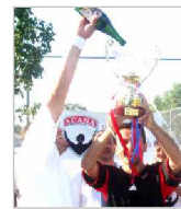
Detroit Captain raises the Cup