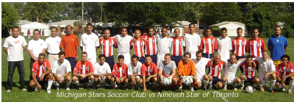
Michigan Stars Soccer Club vs Nineveh Star of Toronto