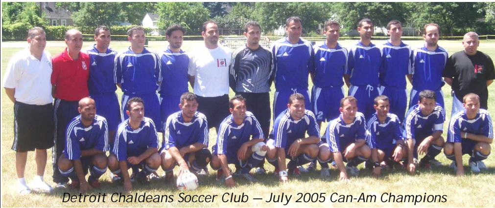
Detroit Chaldeans Soccer Club – July 2005 Can-Am Champions