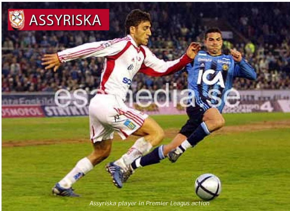
Assyriska player in Premier League action